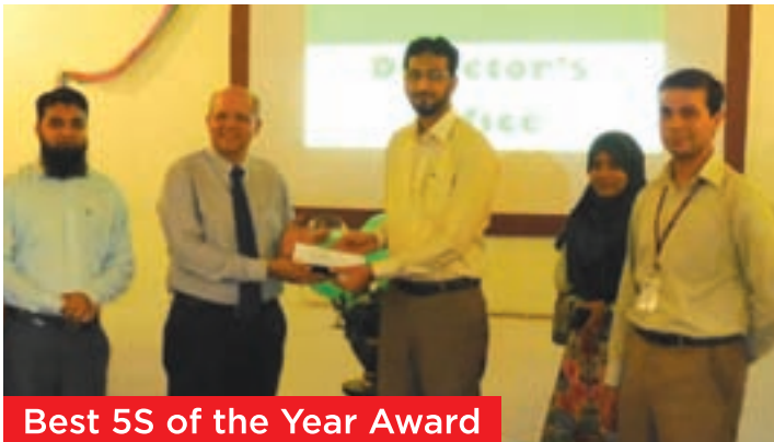
Best 5S of the Year Award