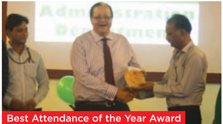
Best Attendance of the Year Award