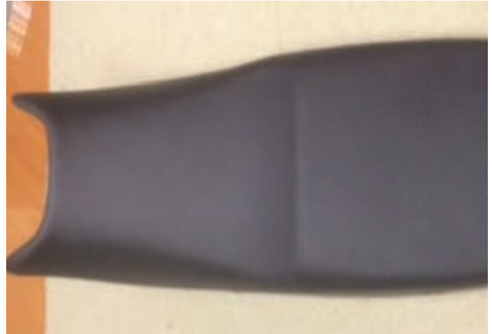
Motorcycle Seat Assembly

In March 2015, the development of Yamaha Motorcycle seat was completed. In just six months, development of base, forming mold, leather, testing equipment development and trolley supply development was done with resounding success. With motorcycle seat assembly manufacturing, PCI Automotive has now opened a new world of opportunities in the two wheels automobile industry.