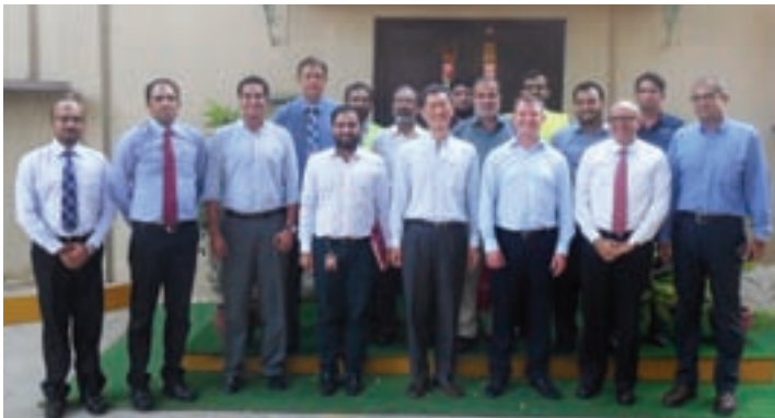
Visit from Global Teams

Packaging business is a whole new world and PCI Materials is striving and is very much capable of reaching the top of this world.