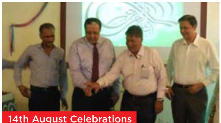
14th August Celebrations