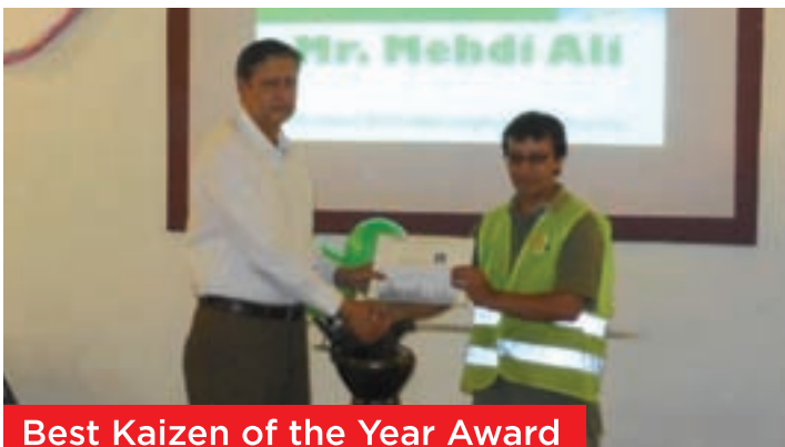
Best Kaizen of the Year Award