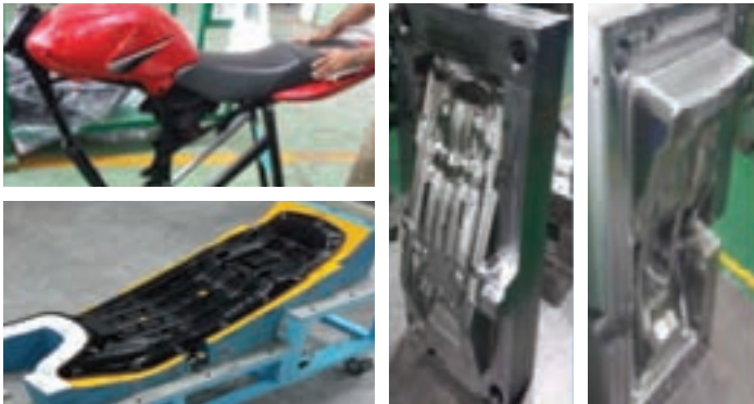
Molds and CFs

PCI Automotive has a history of making the most of every situation. When Yamaha Motors started production in Pakistan, it was PCI Automotive's dynamic team of professionals who targeted Yamaha Motorcycle seats as a potentially diversified business opportunity. And after rigorous efforts, in October 2014, development of Yamaha Motorcycle seats began.