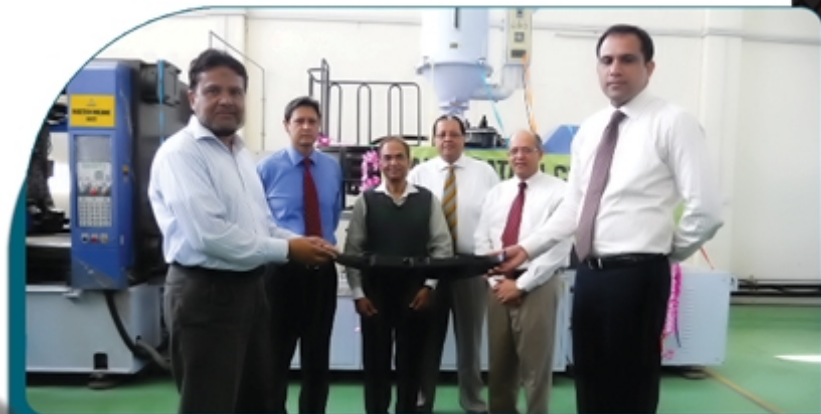
Launching Ceremony of Injection Molding Shop