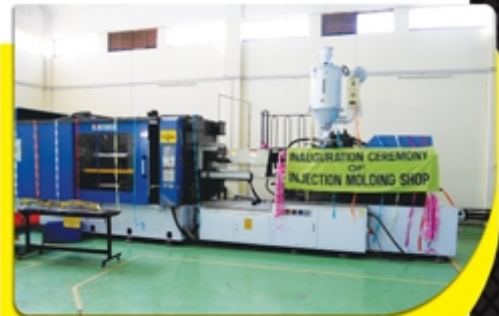
Injection Molding Shop