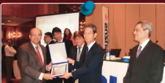
Receiving Award From Pak Suzuki