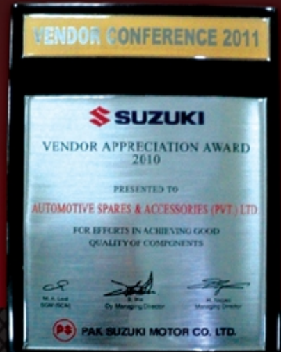
Vendor Appreciation Awards

We hope that all of us would continue the good work and assist the management to achieve greater heights in years to come.